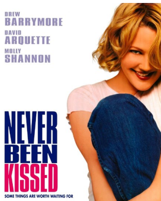
(Wasn't this a movie? Yeah, the girl from ET was in it. It was mid)

"The school system will enhance processes to determine the authenticity of enrollment documents for current and future students as well as modify policy and procedures as warranted," the school system said in a statement late Friday.