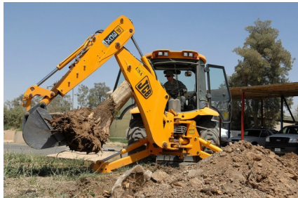
A Konold County worker in the early morning hours of Saturday lifting stuff and putting it back down

Editors Note: We’ll wait and see what the state decides to do, but it needs to be a lot of help and a lot of help right now or the Governor’s otherwise stellar record will be tarnished.