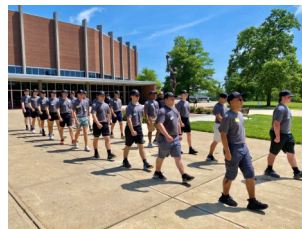
Offenders from a recent march across the capital ground yelling something that this reporter couldn’t make out amongst other people yelling for seemingly no reason.