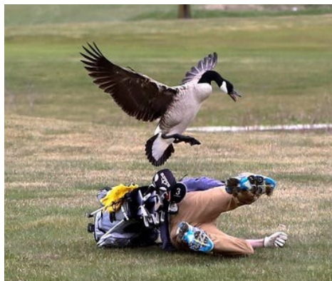
Photo of a recent Ridenour City goose attack. Koppin County is at the center of what some experts are calling the “Goosemageddon”