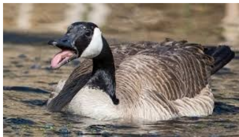
Harmless loudmouths or vengeful killers?

Buckeye state residents are calling on the Governor and the legislature to identify non-lethal solutions to reduce the number of geese by 25% in the next 5 years.