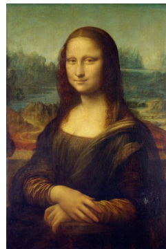
Is she smirking because she's leaving France?

The Louvre currently attracts 2.5 million visitors a year, making it the top visited museum in the world. Landing the "Neuvo Louvo" as it's being called in art circles would bring 8,000 permanent jobs and 17,000 construction jobs to the state. This decision is set to be made within 3 months.