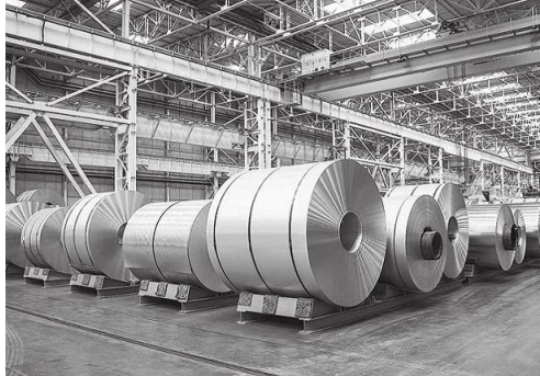
American Roll Form Products in White County currently has 37 open positions

Jobs in the sector pay $27/hr on average.